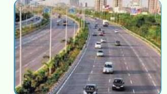
ORR to 30 min. Drive.