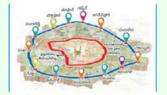
Proposed Regional Ring Road.