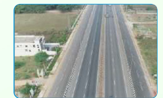
Approved 4 Track Highway.