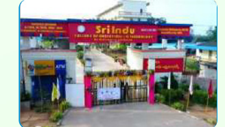
Near by 10 Engineering Colleges.