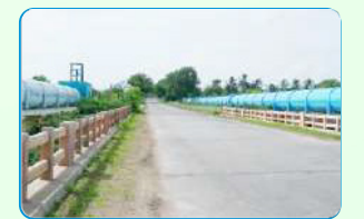
Krishna Drinking Water Lines Passing Through Near The Project