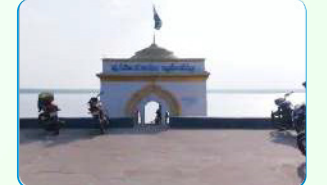
20 min. Drive from Ibrahimpattanam.