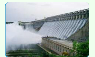
On Nagarjuna Sagar Highway